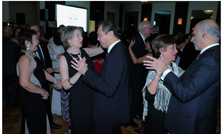
Dancing the Night Away!