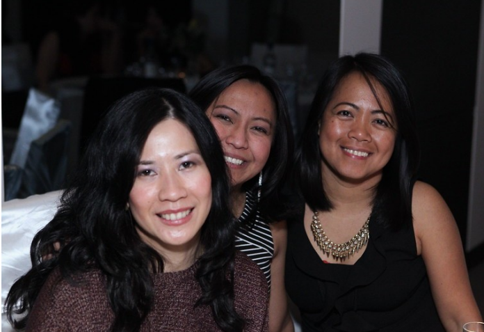
UPAAT Members Enjoying the Night with Friends