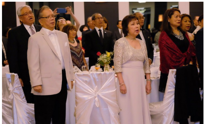
Singing of UP Naming Mahal