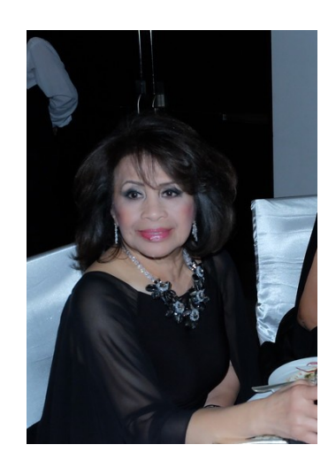
UPAAT Past Presidents